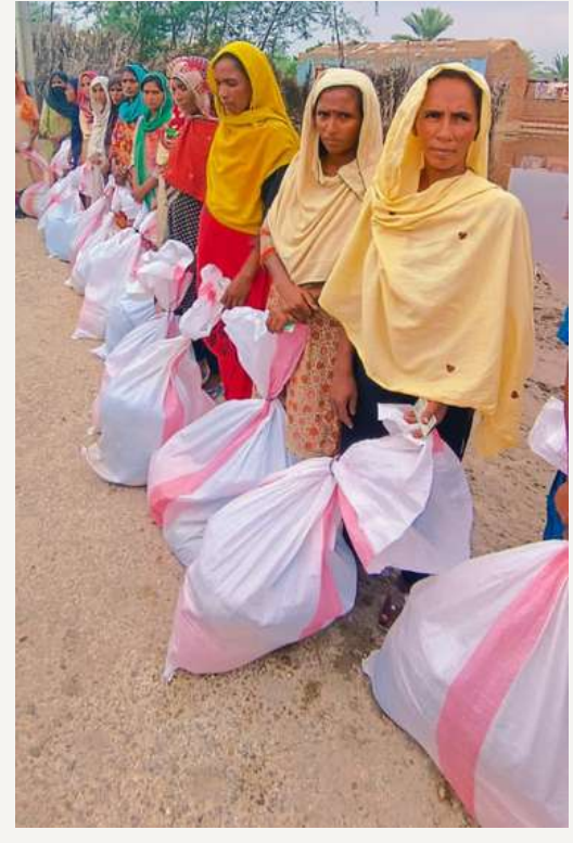
Heavy Torrential Monsoon Rain and Floods 2022- Relief Updates, 24th August, 2022