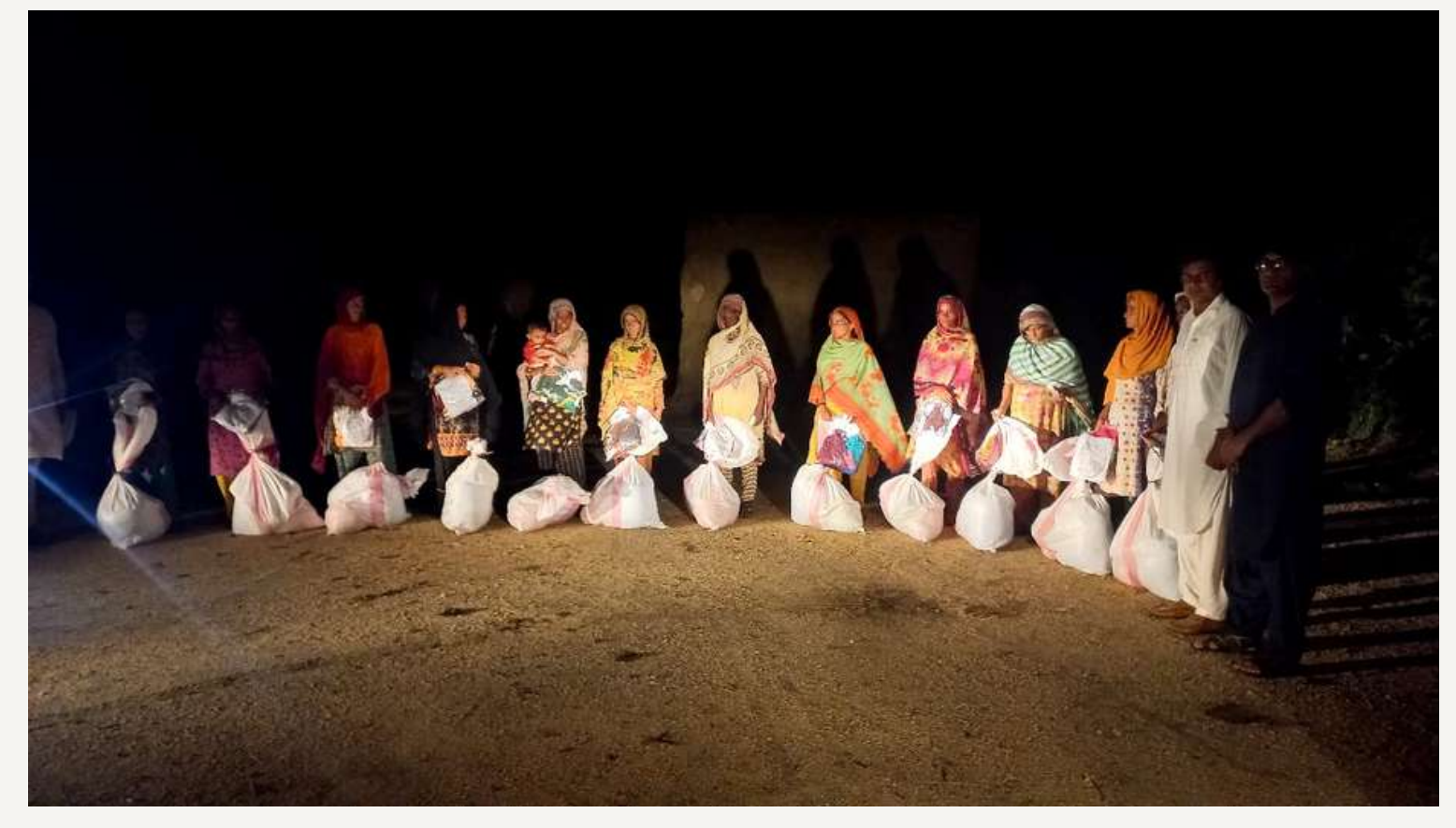
20 Dry Ration bags distributed in Village Adhm Sultan, UC Gondehro, taluka Kotdij-District Khairpur