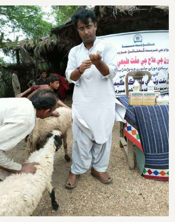
Mirpurkhas- ETV Vaccine to Sheep