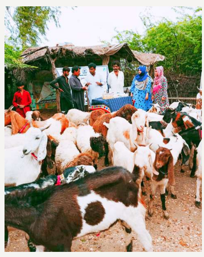
Mirpurkhas- Treatment Checkup of Livestock