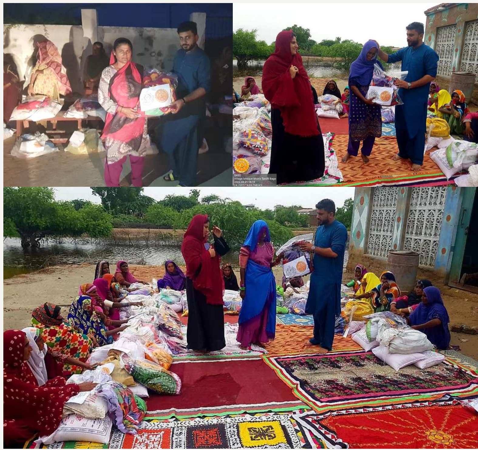
Badin-Dry Ration Bags at Shaheed Fazil Rahou, Tando Bago, and other affected areas.