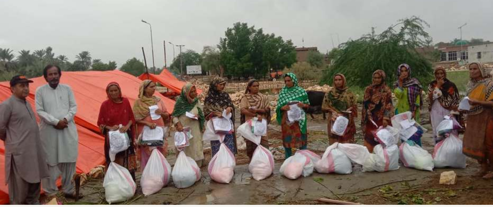
30 Dry Ration bags distributed at Village Nihal sohu, UC Sohu taluka Kotdij at the roadside on old National High way