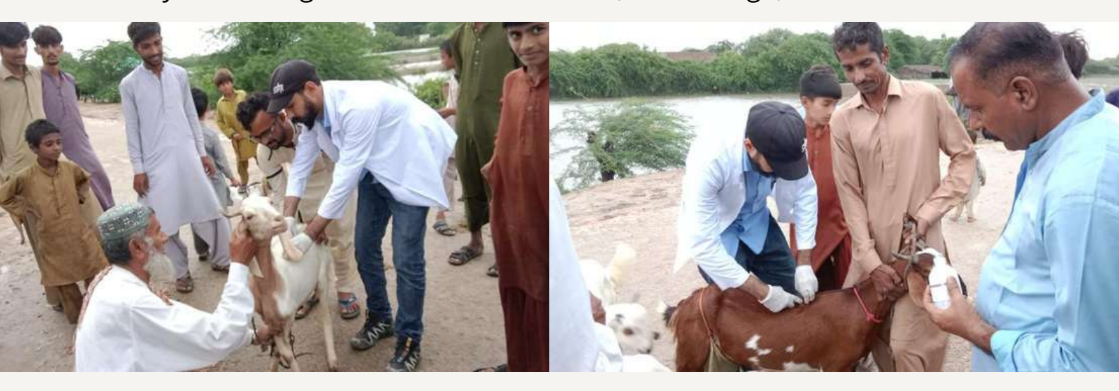
Animal Vaccination Camps at Different villages.